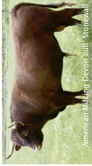
American Milking Devon Bull: Stonewall

Our purpose is to preserve this critically endangered breed in its current state of perfect usefulness and thrift.